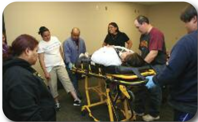
New EMT volunteers practice transporting an injured community member as part of their 112 hours of training.