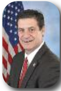
Rep. Chip Cravaack

A critical aspect of my job as your Congressman is keeping in touch with the people I am privileged to represent. It is an obligation I take very seriously. Six months have passed since I took office and I would like to provide you with an update on the various ways we can connect.