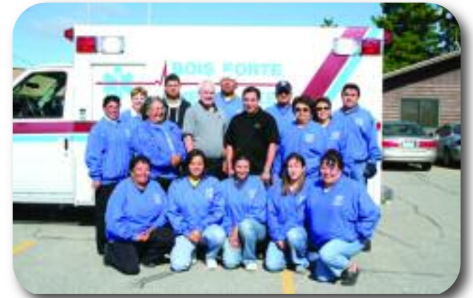
Veterans of the Ambulance crew look forward to new volunteers to help serve the community.

take time away from their evenings and weekends (over and above their main careers) is a true labor of love. Thank heavens there are people like them."