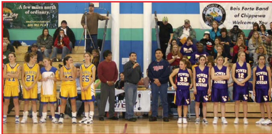
The Tribal Council welcomes everyone.