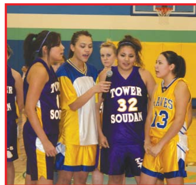
Student - Athletes from both teams sing the National Anthem.